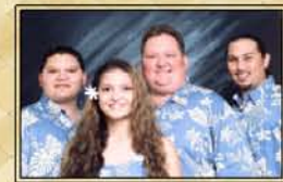
(see page 4 for more details)